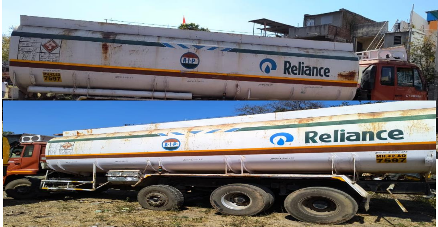
Page 4 of 4